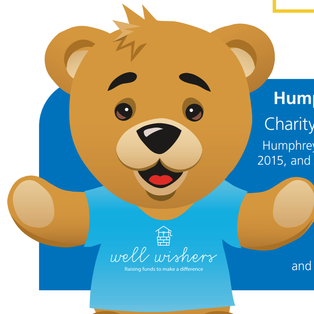
Humphrey Charity Mascot

We work closely with the Communications Team here at Walsall Healthcare NHS Trust. The team helps us in strengthening our engagement - by writing countless media stories, designing posters for our upcoming events or keeping our website up to date; playing a huge role in Well Wishers' prominence within Walsall and surrounding areas.