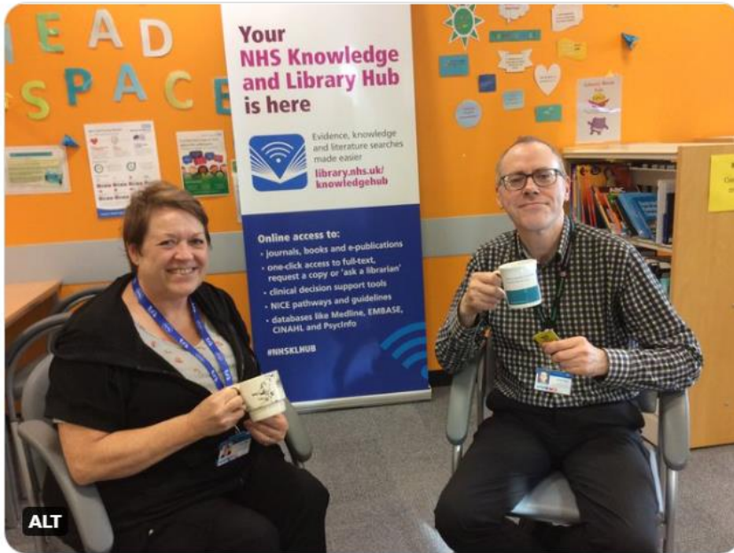
You and Walsall Healthcare