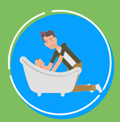
Try giving them a warm bath.