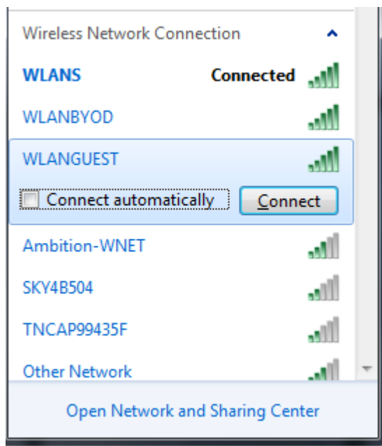
Fig 1 screen shot of the typical WLAN connections list